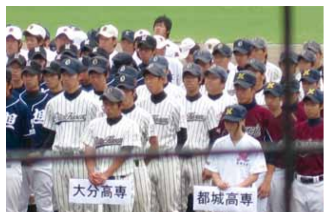
▲ Baseball Club