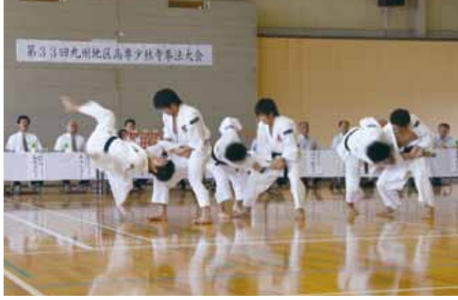
▲ Shorinji-kempo Club